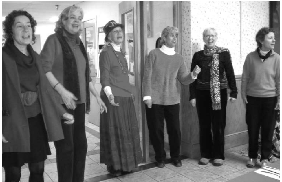
The Brattleboro Women's Chorus sings for Thompson House residents.

In February, we also enjoyed art, entertainment and music. Our