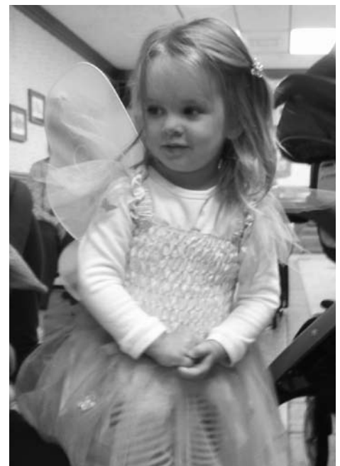
A sweet little angel visited us for Halloween.