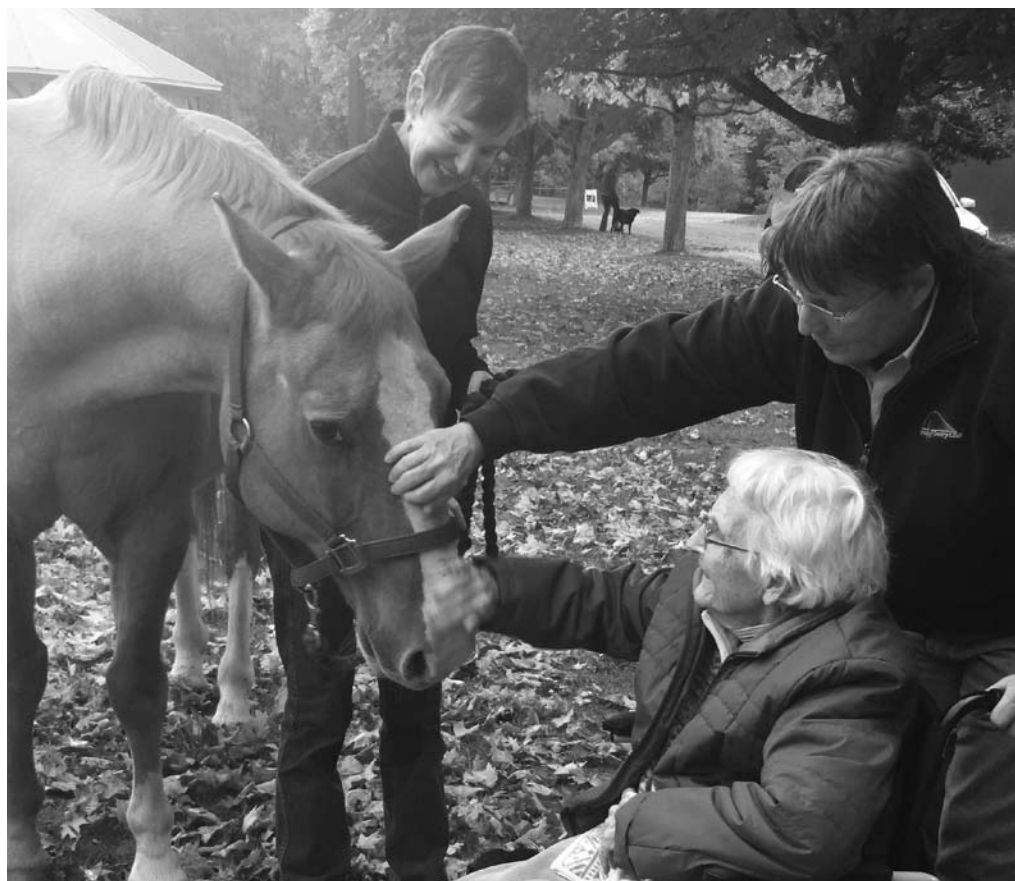
We met beautiful horses and very nice people at Winchester Stables in Newfane, VT.