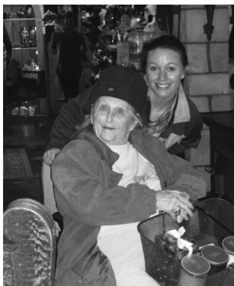
We enjoyed holiday shopping during our recent trip to Yankee Candle.