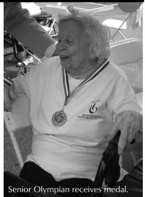
Senior Olympian receives medal.